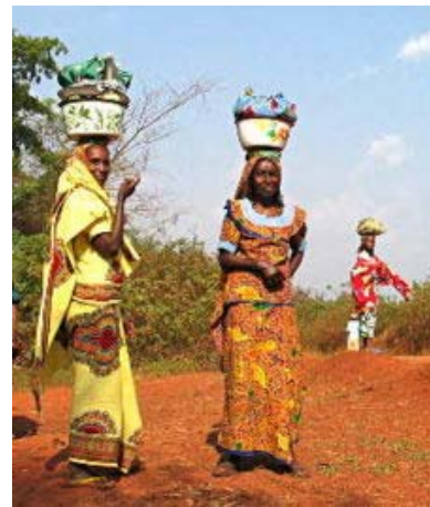
Fula women in the East Province of Cameroon.