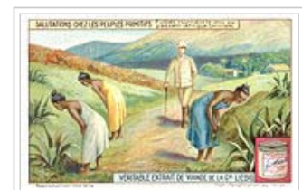
Popular illustration of Fula greeting ritual ca. 1910, in French it reads: Salutations among primitive people.

The Fula have a rich musical culture and play a variety of traditional instruments including drums, hoddu (a plucked skin-covered lute similar to a banjo) and riti or riiti (a one-string bowed instrument similar to a violin), in addition to vocal music. The well known Senegalese Fula popular musician Baaba Maal sings in Pulaar on his recordings.