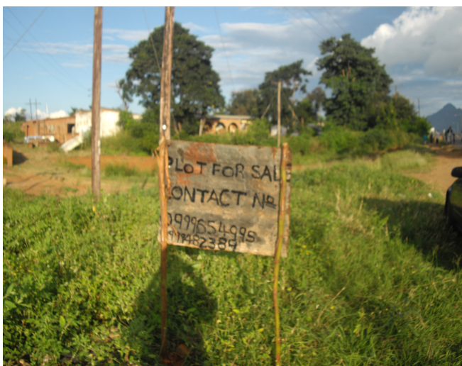
Figure: Advertisement for land, Blantyre (Malawi)

This dissertation project aims at analysing practices taking place in the peri-urban villages of Blantyre City, Malawi. Preliminary findings from a 10 month fieldwork indicate an increase in both the practice of selling land and the price of land. Most people buying the land are from the city, and the major reason is for residential development. While selling land brings instant money, the actual dynamics are partially appreciated.